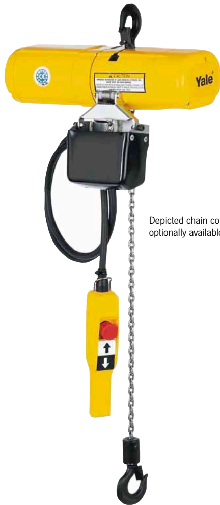
Depicted chain container optionally available.