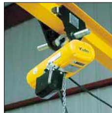
Smallest and lightest electric chain hoist for a great number of applications.

! Yale hoists and trolleys are not designed for passenger elevation applications and must not be used for this purpose.