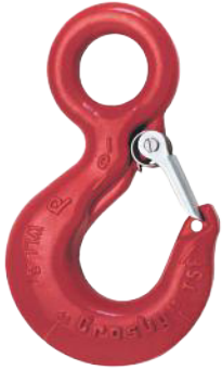
L-320CN Frame Size D-N