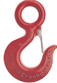
L-320C Frame Size O-T