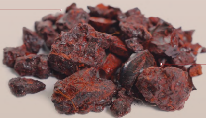
Dragon's Blood resin