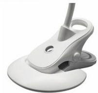
Use with Base