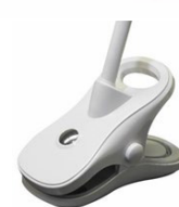
Use with Clip