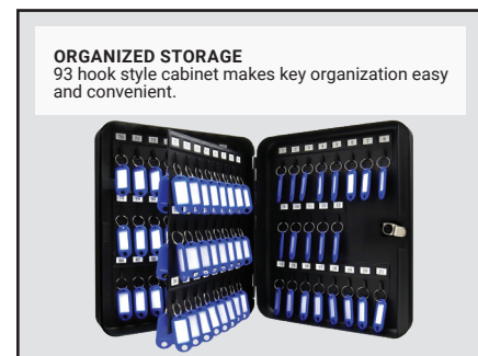
ORGANIZED STORAGE 93 hook style cabinet makes key organization easy and convenient.