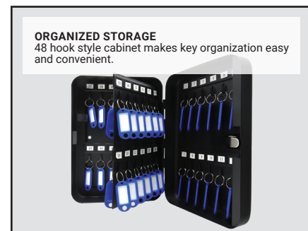
ORGANIZED STORAGE 48 hook style cabinet makes key organization easy and convenient.