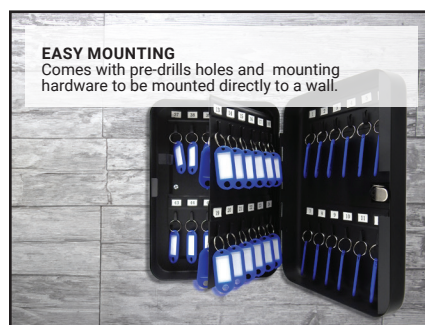
EASY MOUNTING Comes with pre-drills holes and mounting hardware to be mounted directly to a wall.

Manhattan - A Royal Sovereign Company. Manhattan is manufactured and distributed by Royal Sovereign. RS International Canada Inc. 191 Superior Blvd. Mississauga Ont. L5T 2L6 Tel: (905) 461-1095 www.royalsovereign.ca