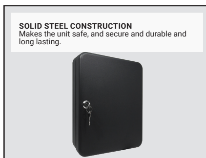
SOLID STEEL CONSTRUCTION Makes the unit safe, and secure and durable and long lasting.