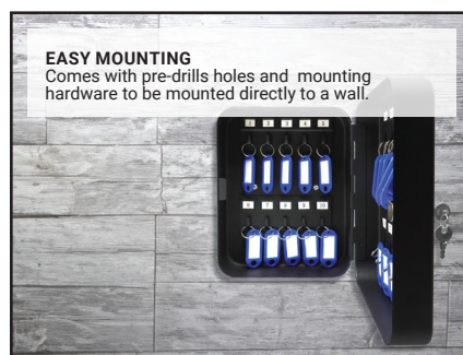
EASY MOUNTING Comes with pre-drills holes and mounting hardware to be mounted directly to a wall.

Manhattan - A Royal Sovereign Company. Manhattan is manufactured and distributed by Royal Sovereign. RS International Canada Inc. 191 Superior Blvd. Mississauga Ont. L5T 2L6 Tel: (905) 461-1095 www.royalsoverign.ca