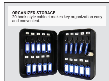
ORGANIZED STORAGE 20 hook style cabinet makes key organization easy and convenient.