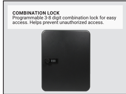
COMBINATION LOCK Programmable 3-8 digit combination lock for easy access. Helps prevent unauthorized access.