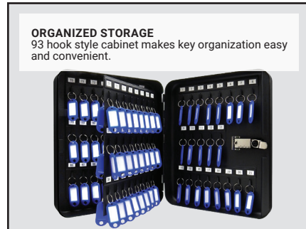
ORGANIZED STORAGE 93 hook style cabinet makes key organization easy and convenient.