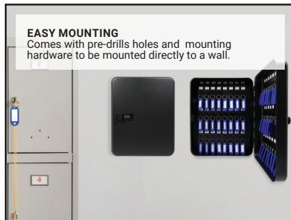
EASY MOUNTING Comes with pre-drills holes and mounting hardware to be mounted directly to a wall.

Manhattan - A Royal Sovereign Company. Manhattan is manufactured and distributed by Royal Sovereign. RS International Canada Inc. 191 Superior Blvd. Mississauga Ont. L5T 2L6 Tel: (905) 461-1095 www.royalsoveriegn.ca