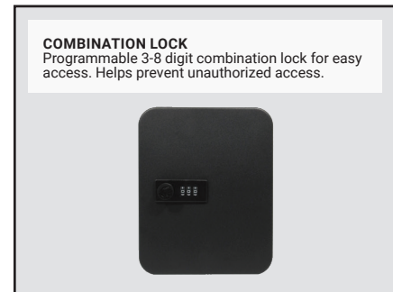
COMBINATION LOCK Programmable 3-8 digit combination lock for easy access. Helps prevent unauthorized access.