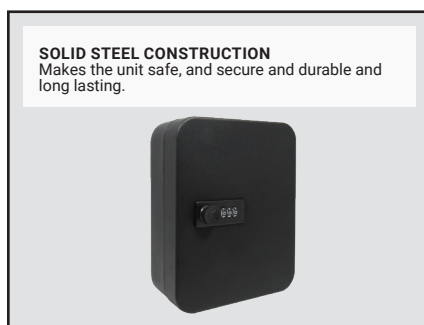
SOLID STEEL CONSTRUCTION Makes the unit safe, and secure and durable and long lasting.