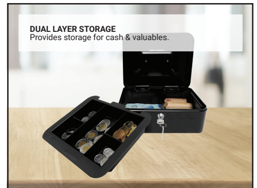
DUAL LAYER STORAGE Provides storage for cash & valuables.