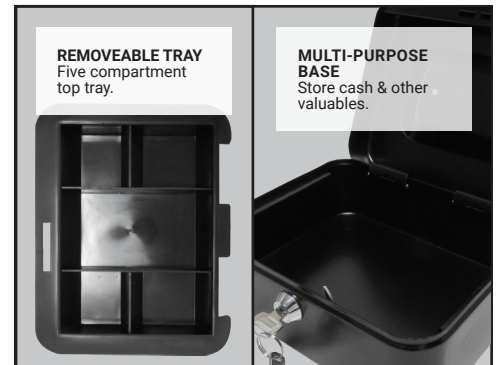
REMOVEABLE TRAY Five compartment top tray.