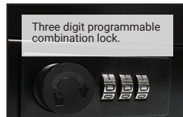
Three digit programmable combination lock.