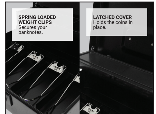
SPRING LOADED WEIGHT CLIPS Secures your banknotes.