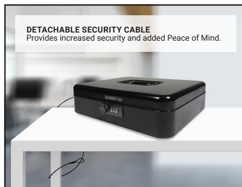
DETACHABLE SECURITY CABLE Provides increased security and added Peace of Mind.