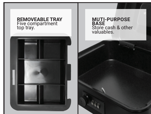
REMOVEABLE TRAY Five compartment top tray.