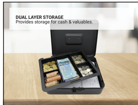
DUAL LAYER STORAGE Provides storage for cash & valuables.