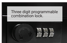
Three digit programmable combination lock.