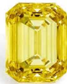
Emerald cut, Fancy vivid-yellow

The secondary color is one of a more expensive colored diamond then the price goes up - green yellow and orange yellow diamonds are more expensive than pure yellows.