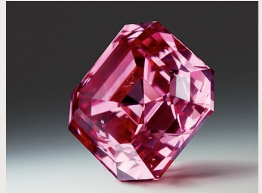
ARGYLE IRIS 1.43 carat square emerald, Fancy Purplish Red