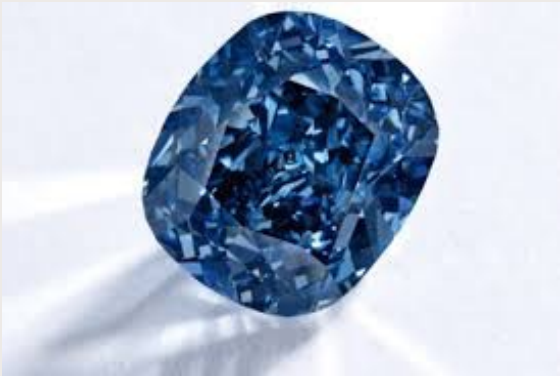
The Blue Moon diamond, the largest blue cushion diamond, sold at auction for $ 48 million.

Similar to all other fancy colored diamonds, natural blue diamonds are made by nature. Blue diamonds are actually found with their beautiful blue color tone. The blue diamond gets its color due to an impurity called boron, along with nitrogen present in its atomic structure. While, The pink diamond seems to get its color from the stress imposed on its atomic structure during the formation of the crystal.