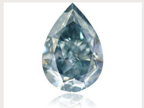
1.10-Carat Fancy Greyish Blue Pear Shaped Diamond, IF

Their prices are determined based on the diamond's color, color intensity, size, and clarity with an emphasis on the intensity of the color. Most blue diamonds are rare, but blue diamonds with very high color intensity that display a deep blue color are the rarest. Of course large stones are even harder to come by and much pricier.