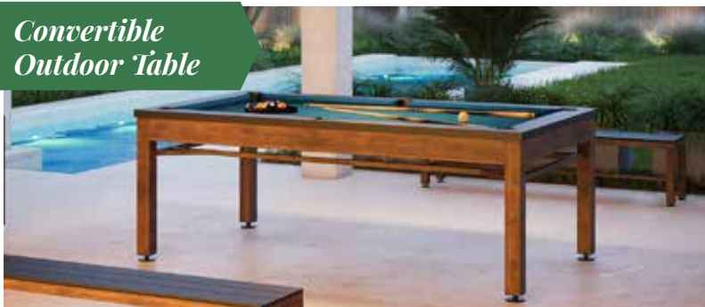
Convertible Outdoor Table