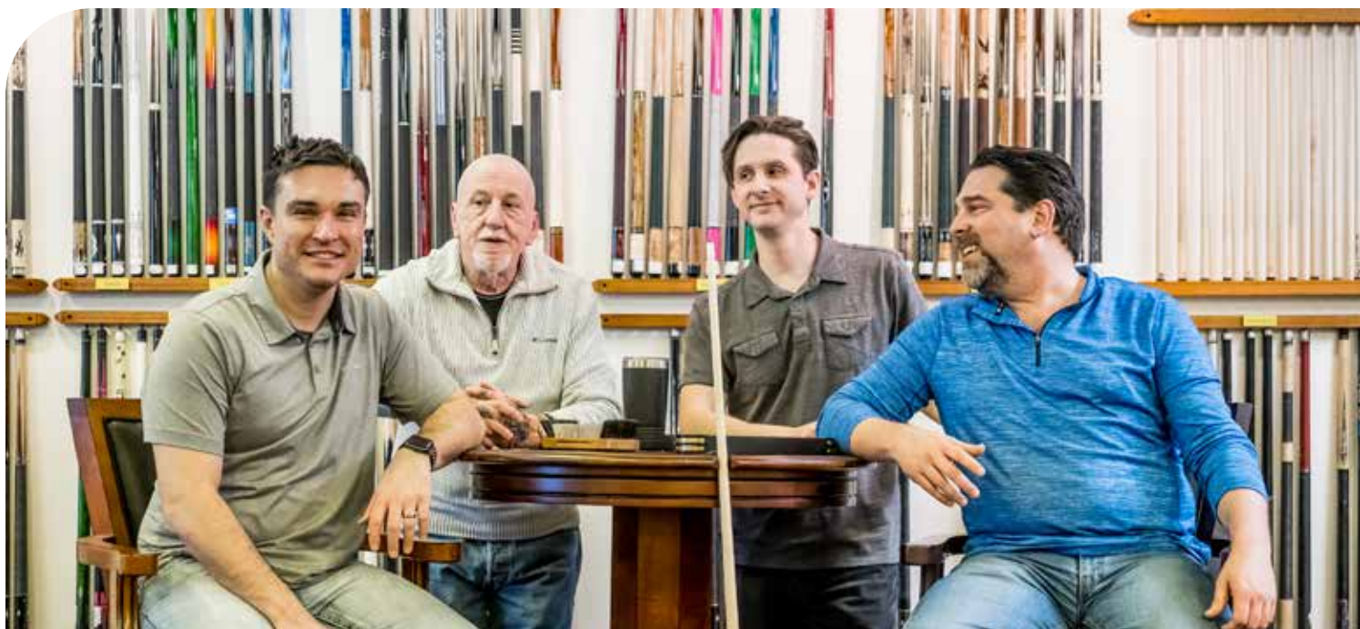
The friendly pool table experts at our Portland, Oregon showroom.

Spencer Marston pool tables are sold through PoolTables.com, either online or through nationwide showrooms. Our team has a combined 100 years in the business, so we can answer any question about billiards. We'll walk you through every step of the pool table selection and purchase process. And, our white glove installation service by a vetted pool table installer means zero setup stress, all you have to do is enjoy your table!