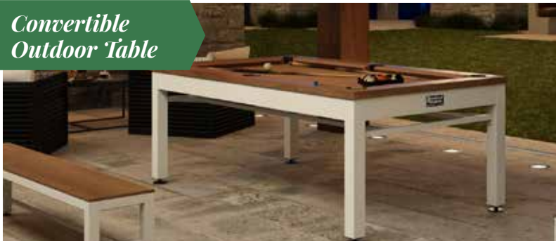
Convertible Outdoor Table