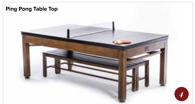
Ping Pong Table Top