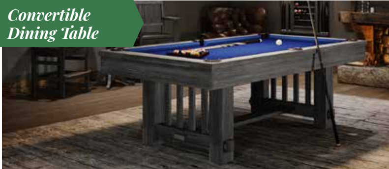
Convertible Dining Table

Table style is a purely personal choice, and whether you opt for a modern, traditional, or convertible table of comparable quality, the play is the same. More and more people are choosing pool tables that can do double or triple duty. Pool tables can be converted to dining tables or game tables (like ping pong) to maximize space, and outdoor tables let you enjoy your favorite game on your deck or patio without fear of the elements.