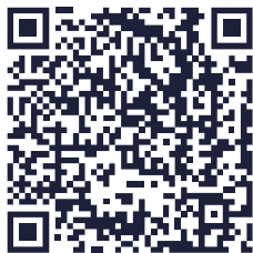
MANGO POWER App

The MANGO POWER app allows you to remotely control your device, giving you peace of mind no matter where you are. Scan the QR code to download the app and get started.