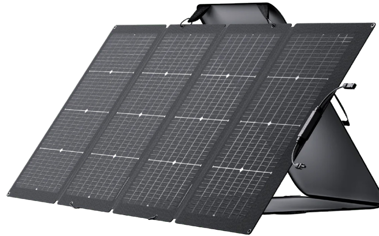
EcoFlow 220W Bifacial Portable Solar Panel