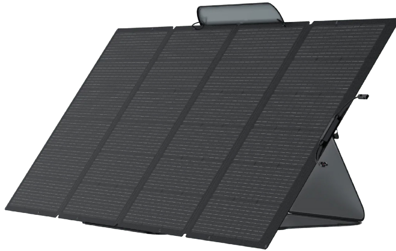
EcoFlow 400W Portable Solar Panel