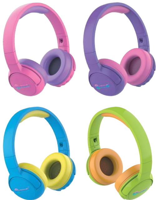
KB5 Bluetooth Headphones