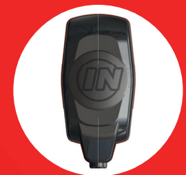
COMPATIBLE F3015 Battery 2-3 hrs of autonomy

T he E50048 olive harvester allows growers to harvest 3x faster compared to manual hand harvesting.