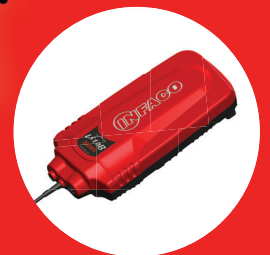
COMPATIBLE L810B Battery 8 hrs of autonomy