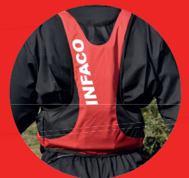
COMPATIBLE F3010 Battery 2-4 hrs of autonomy

Infaco's patented elliptical system essentially moves the rake head in an oval motion. This special movement optimizes harvest times and reduces bruising. Olives fall close to the trunk instead of being flung outwards and missing the nets.