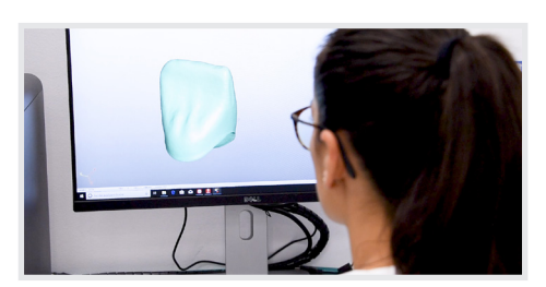
1. Scanning and design