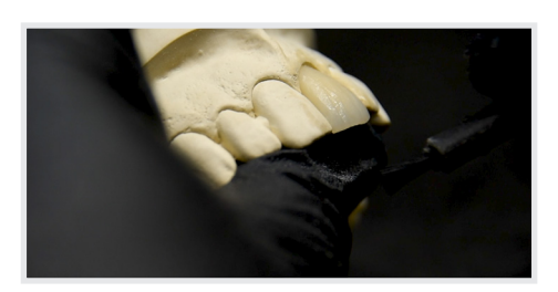
9. Aply adhesive and light-cure