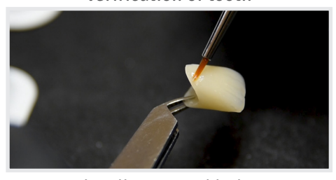
6. Aply adhesive and light-cure