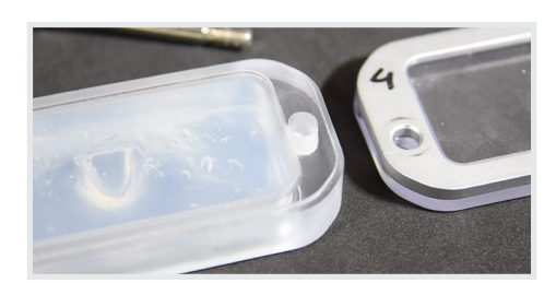
5. Muffles preparation