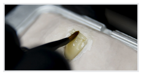
7. Muffle process