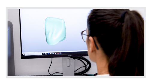
1. Scanning and design