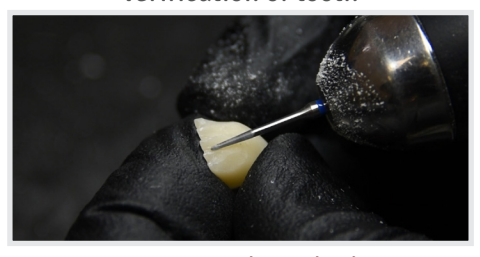
6. Cut-Back method