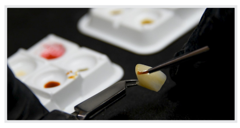
7. Stain and glaze of light-curing tooth