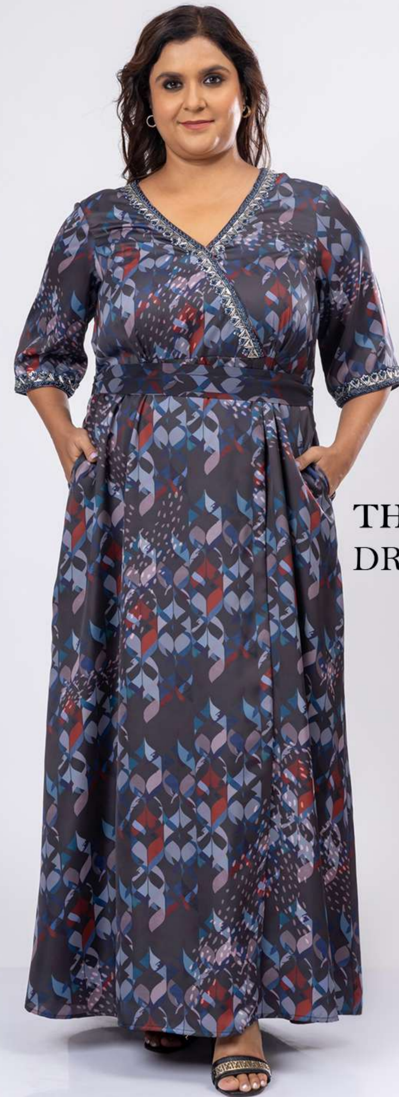
THE NIGHT WATCH BLACK DRESS WITH SLIT AND BELT