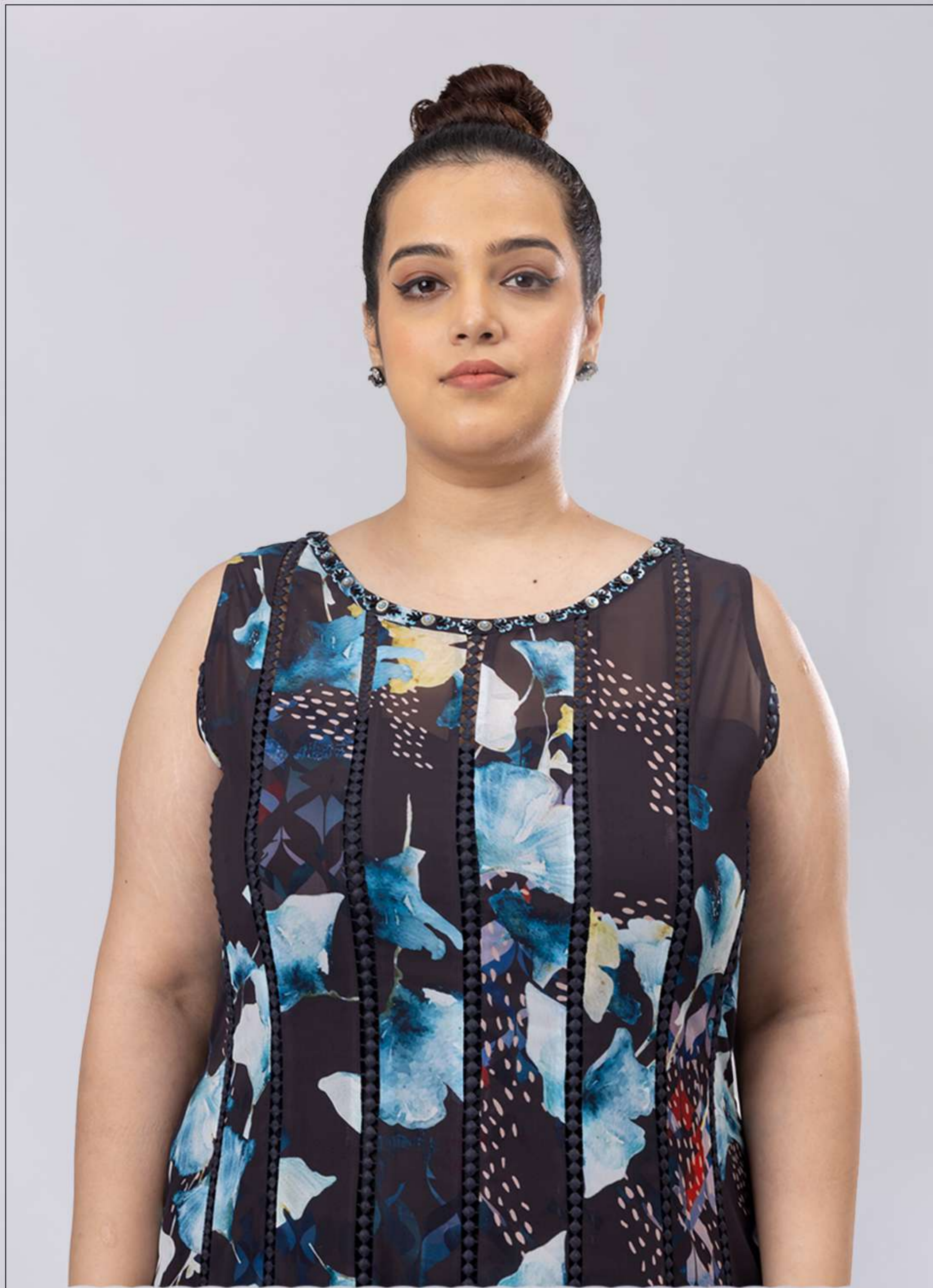
THE STARRY NIGHT BLACK GOWN