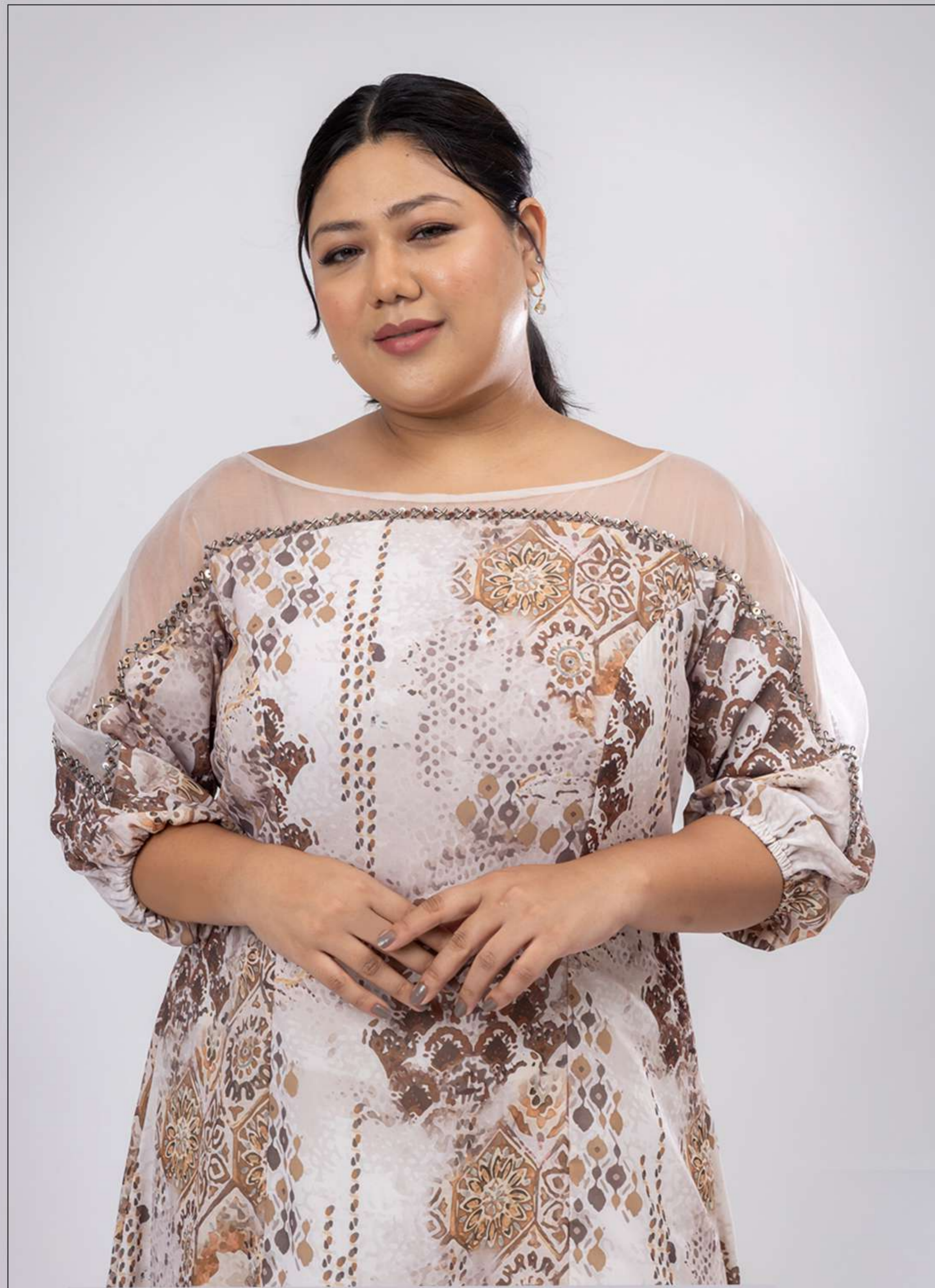
WHEATFIELDS BOAT NECK EMBROIDERED GOWN