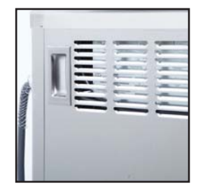
Shown with standard pull handles