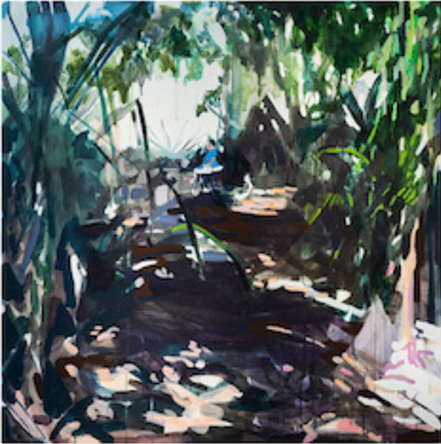
PEARL IN THE CACTUS GARDEN I