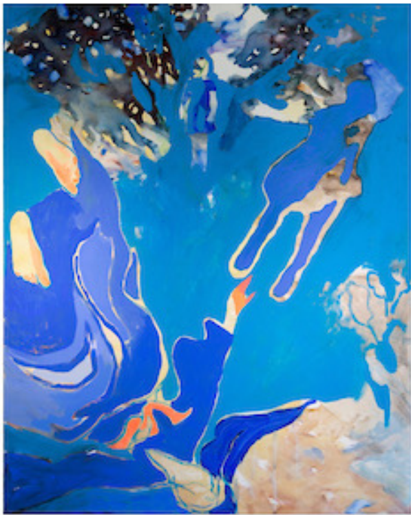
TWO PEARLS AND A VIRGIN MOTHER