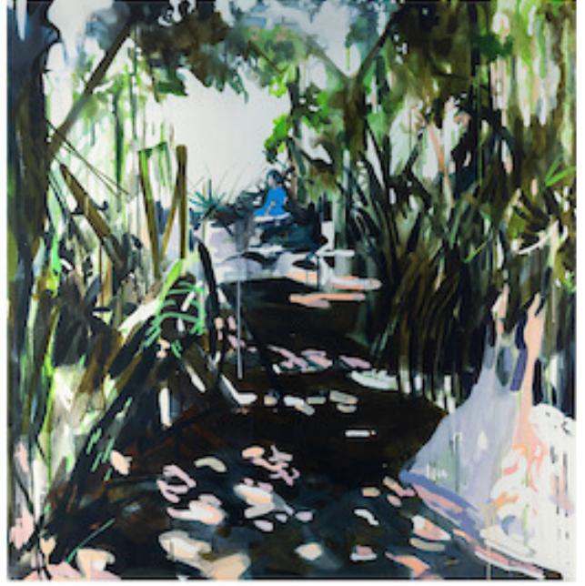
PEARL IN THE CACTUS GARDEN II