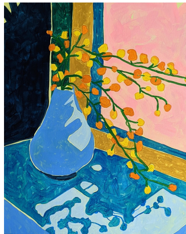
BLUE POT IN WINDOW