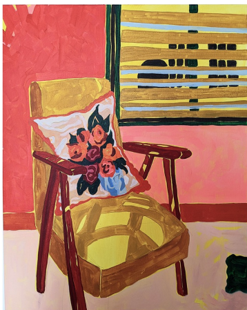
CHAIR WITH BLIND