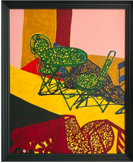
KINGS ROAD TABLE AND CHAIR