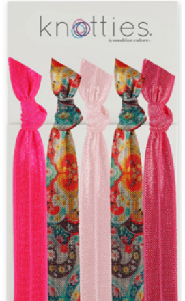
LITTLE MISS PAISLEY