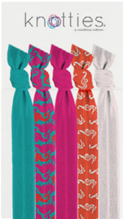
LAY OF THE LAND