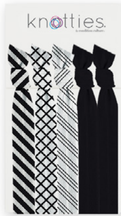
GET IN LINE