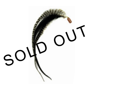
HALF MOON 10071103 Wholesale $15 | Retail $30