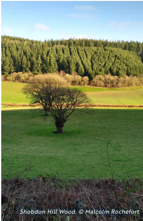
Shobdon Hill Wood