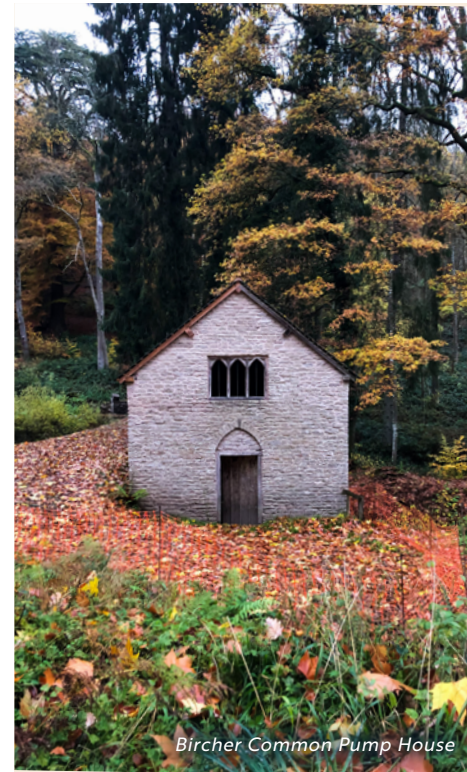
Bircher Common Pump House

After passing by Lodge Farm on a gradually climbing track, the Trail opens out onto the National Trust-owned Bircher Common, with two fine mixed coppices – Oaker and Bircher – on its southern flanks, and more fantastic views.