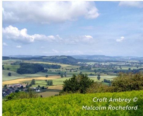
Croft Ambrey

The Trail enters Croft Woods on an easy forest track before ascending steeply to the ramparts of Croft Ambrey Iron Age hillfort. Standing at almost 1000ft above sea level, the large multi-enclosure site dates from around 390BC and massive, ancient horse-chestnut trees are dotted around the site. Breathe in the views and consider a worthwhile detour to Croft Castle, which is also in the care of the National Trust.