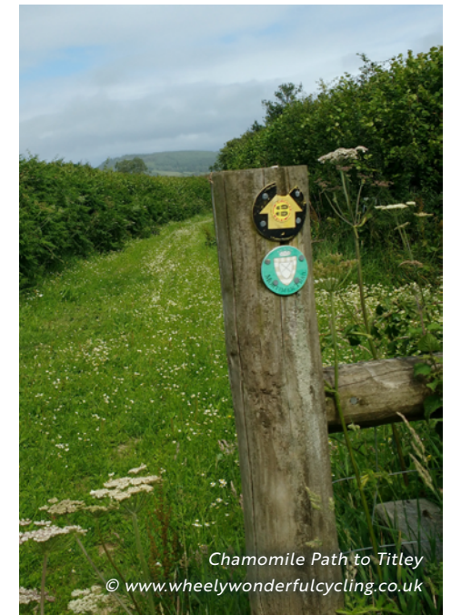
Chamomile Path to Titley

Dipping in and out of woodland, the trail follows the hilltop path above Little Brampton Scar. It then descends before breaking south uphill again across fields to the edge of Kennel Wood.