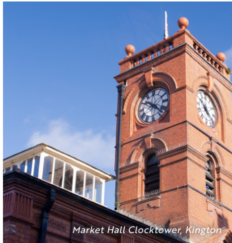
Market Hall Clocktower, Kington

The trail descends from Rushock Hill, eventually crossing the B4355.