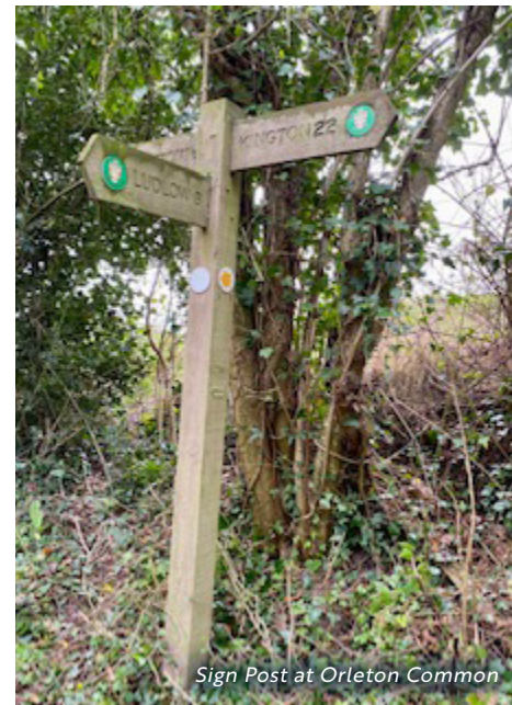
Sign Post at Orleton Common