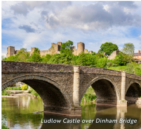
Ludlow Castle over Dinham Bridge