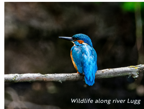
Wildlife along river Lugg

Walkers come out onto a lane where the Lugg is crossed on the lovely Lyepole Bridge, before making the steep ascent to Shobdon Hill Wood.