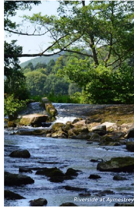
Riverside at Aymestrey