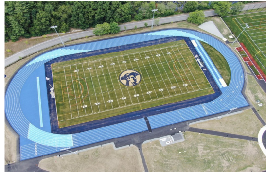
Lexington Minuteman Field