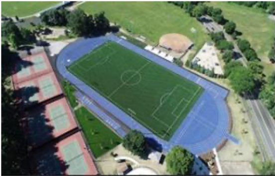
Lexington Center Field