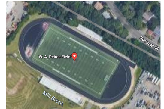
Arlington Pierce Field

Spring (till June 17): Mon & Wed nights, 8.30PM-10.30PM (Lexington Center Field)