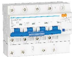
★ DZ158LE, 4P