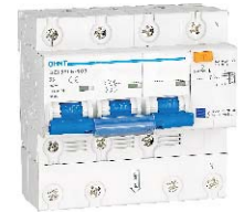
★ DZ158LE, 3P+N