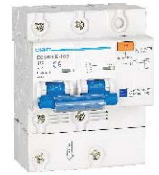
★ DZ158LE, 2P