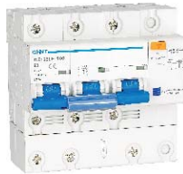
★ DZ158LE, 3P