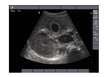
Transverse Thick-walled Gallbladder, captured on the MicroMaxx ultrasound system with the C60e/5-2 MHz transducer.

The SonoSite® MicroMaxx® ultrasound system—a breakthrough in image quality and portability that will forever change the way medicine is practiced. A hand-carried unit that performs like bigger, heavier, cart-based systems, the MicroMaxx offers you impressive image quality in a light, 8-pound unit no bigger than your average laptop.