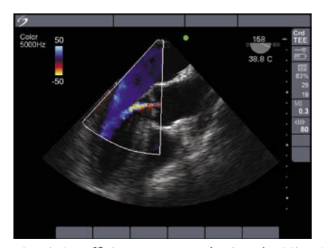
Aortic Insufficiency, captured using the MicroMaxx ultrasound system and TEE/8-3 MHz transducer.

The MicroMaxx system's compact size, light weight and ease of use would be a novelty if it weren't for the image quality. Many assume that because a system is not a heavy cart, it can't produce a quality image. The MicroMaxx system's SonoRES™ speckle reduction technology shatters preconceptions by providing scans that are comparable to cart-based systems—impressive when you consider they're produced from a hand-carried unit.