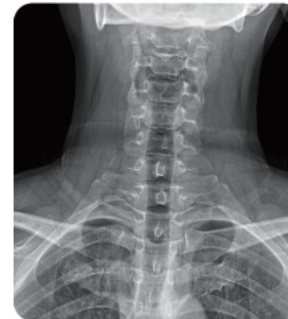
frontal cervical spine