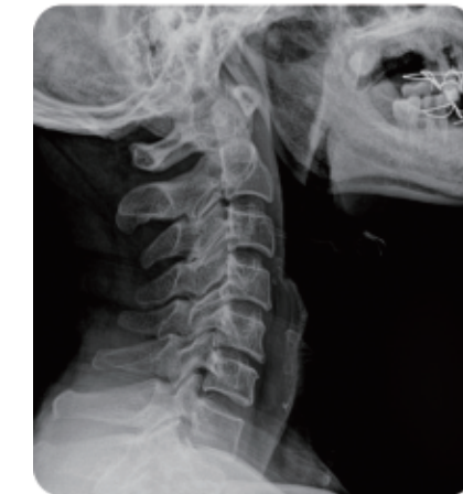
lateral cervical spine