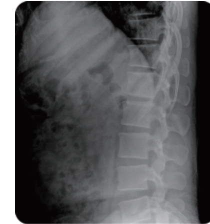
lateral lumbar spine