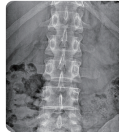
frontal lumbar spine

High quality portable FPD, outstanding acquisition conversion performance, the sharp clinical image can be guaranteed. It can realize digital radiography of all human body parts friendly, like head, limbs, chest, spine lumbar and so on.