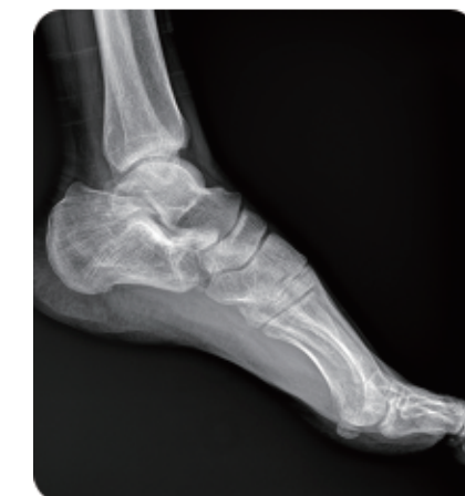
lateral ankle spine