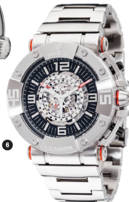
DETOMASO MACHINEER €365 WWW.DETOMASO-WATCHES.COM