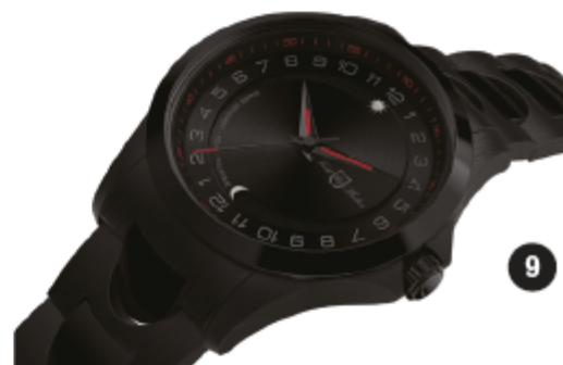
#YOURTIME $650 TODD & MARLON WWW.TODDANDMARLON.COM INFO@TODDANDMARLON.COM