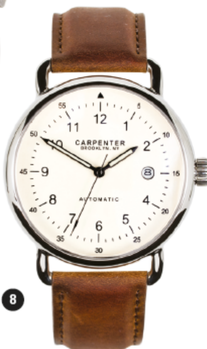
THE CARPENTER AUTOMATIC FIELD WATCH $595 USD WWW.CARPENTERWATCHES.COM INFO@CARPENTERWATCHES.COM