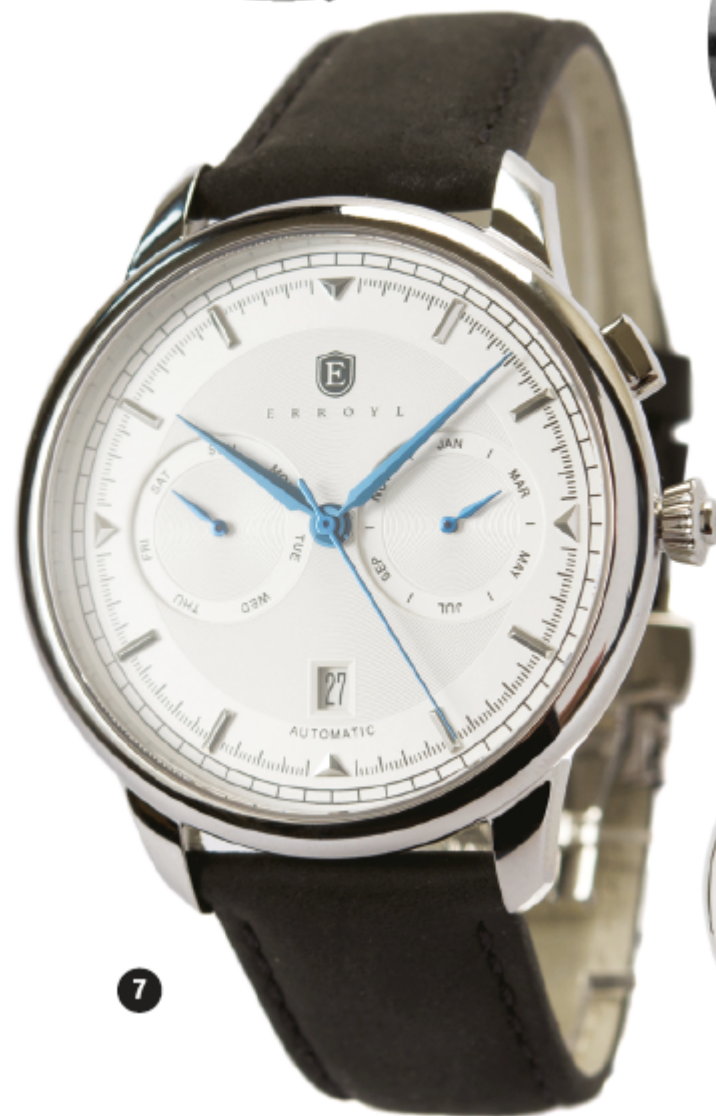
REGENT LUNA £285 GBP ERROYL - MECHANICAL TIMEPIECES WWW.ERROYL.COM