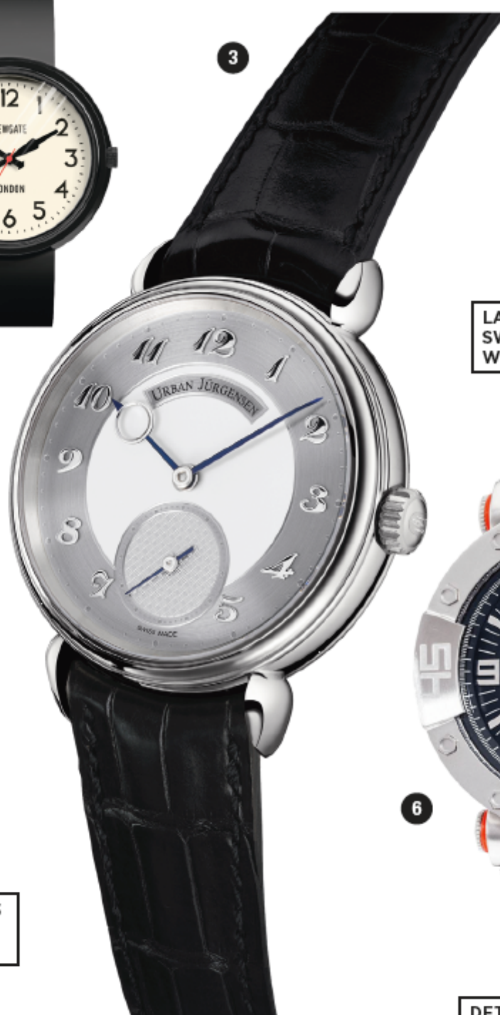
REFERENCE 1140L PLATINUM UJS P4 IN-HOUSE MOVEMENT LEVER ESCAPEMENT MANUAL WINDING 40 MM RRP CHF 34.500 WWW.URBANJURGENSEN.COM +41 3236 51526