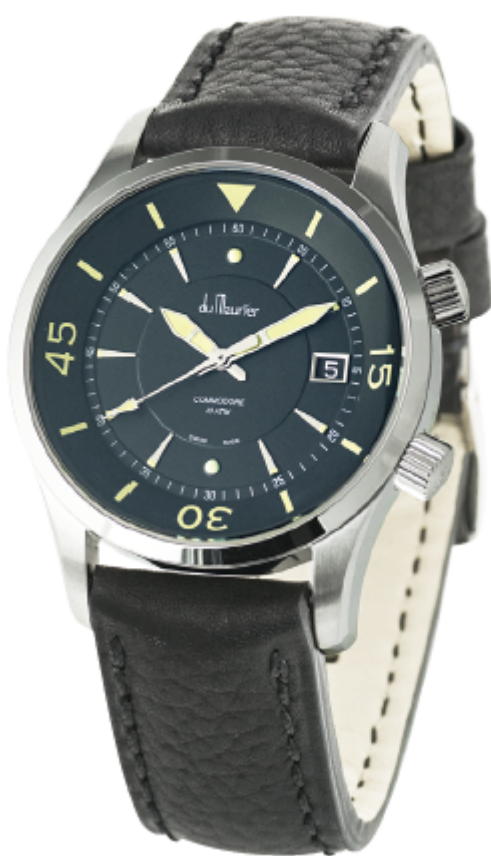
DU MAURIER WATCHES THE COMMODORE WITH WATERPROOF LEATHER STRAP £465 WWW.DUMAURIERWATCHES.COM