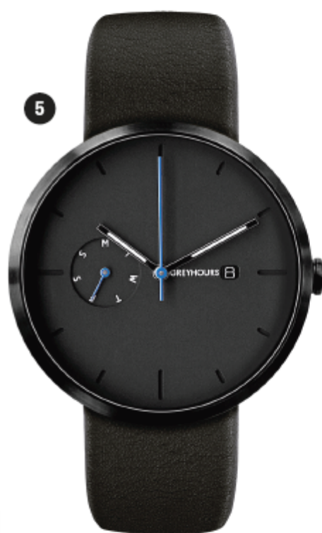
ESSENTIAL DARK HOURS £165 GREYHOURS WWW.GREYHOURS.COM