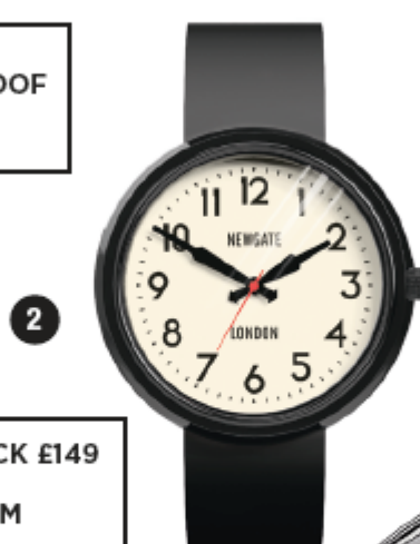
THE ELECTRIC GRAND IN BLACK £149 NEWGATE WATCHES WWW.NEWGATEWATCHES.COM