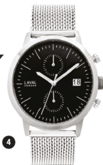
LAVAL SWISS MESH CHRONO WATCH WWW.LAVALOFFICIAL.COM