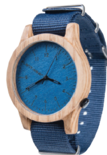
HERITAGE SERIES - BLUE EDITION OAK £99 PLANTWEAR WWW.PLANTWEAR.CO.UK INFO@PLANTWEAR.CO.UK