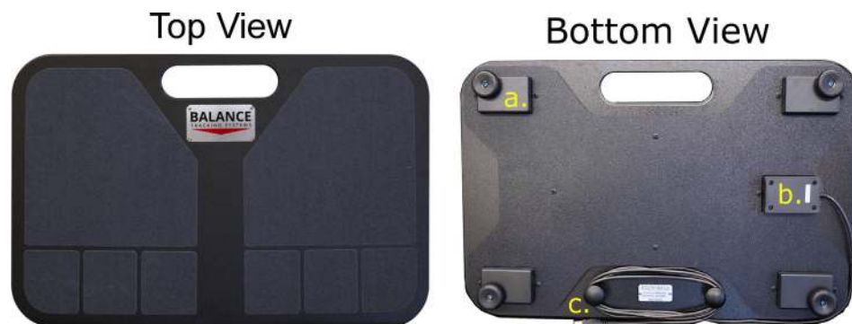
Fig. 1. Top (left) and Bottom (right) views of the BBP. Labelled are (a) one of the four enclosed sensors in the plate corners, (b) the enclosed bridge-type circuit board, and (c) the USB connector for interfacing with the laptop.

Summary values from the above metrics (i.e. ICC, accuracy and precision) were further subjected to paired t -test analyses to determine the effect of direction (X vs. Y). Statistical significance was considered at the p < 0.05 level. As a final step, inter-device