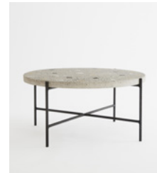
LARGE 80cm(D) × 40cm(H) Weight 55kg