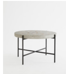
SMALL 60cm(D) × 40cm(H) Weight 30 kg