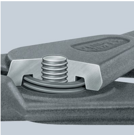
Spring inside the joint: the spring is protected inside the precisely bolted joint. It does not hinder work and cannot get dirty or lost.