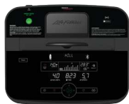
Track Connect 2.0 with Enhanced Bluetooth