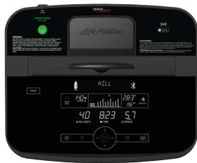
Track Connect 2.0 with Enhanced Bluetooth