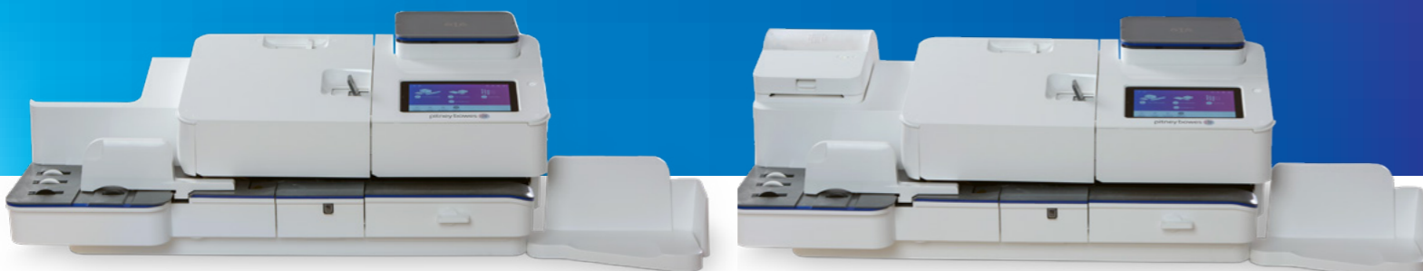
SendPro C Auto