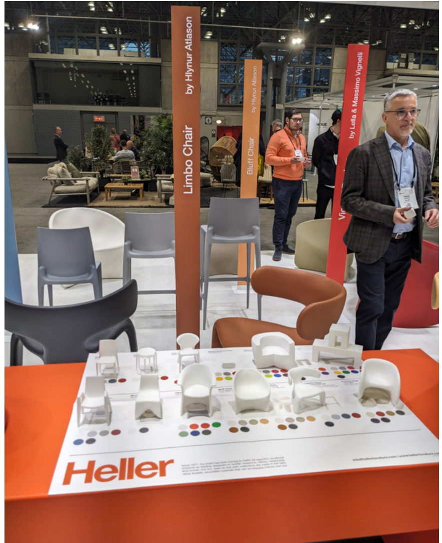
An array of chairs on view at Heller, including Limbo and Bluff.