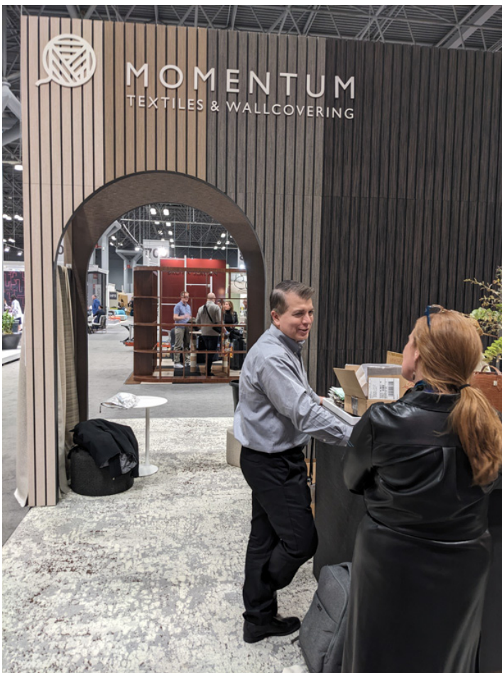
The exterior of the Momentum Textiles & Wallcovering booth featured Pindrop acoustic solutions.

Ethnicraft showed nature-inspired furnishings and accessories that garnered interest from visitors. The Bricks collection transforms recycled wood and offcuts from production into wall art. Handcrafted by in-house artisans, no two pieces are exactly alike. The brand’s popular N701 modular sofa, featuring Eco Fabric from fibers recycled from the fashion industry, is now available in the fresh Moss shade. “BDNY is always an exciting show for us, and this November edition was no different. Marketgoers seemed to