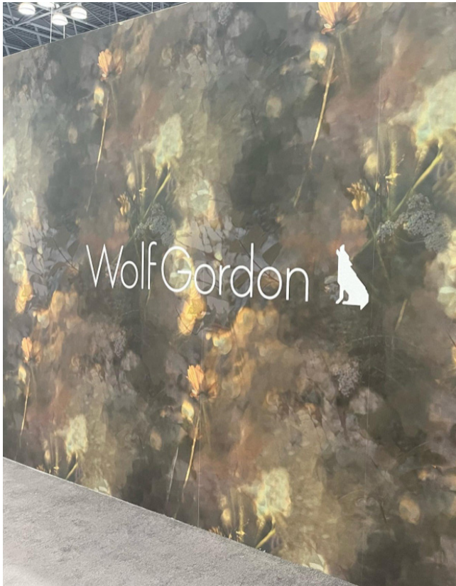
An ethereal pattern printed on GATHER® Acoustical from Wolf-Gordon.

that range from 0.25 to 0.90, they are also ideal in corporate environments. “The noise and the reverb is immediately tamped down, and with the dimensionality, it makes a space warmer and more intimate,” Shaw added.