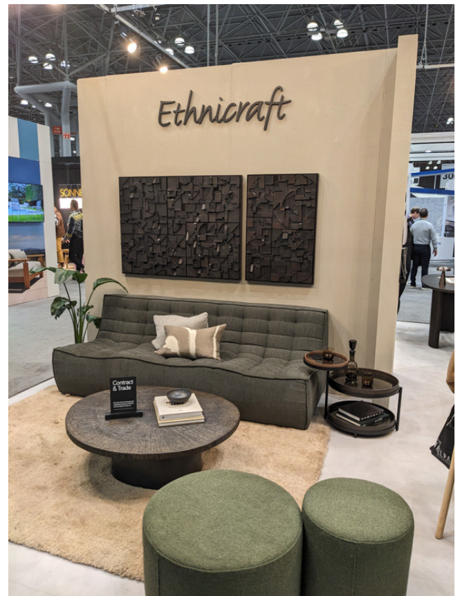
Ethnicraft's Bricks artwork is made from recycled wood and offcuts.