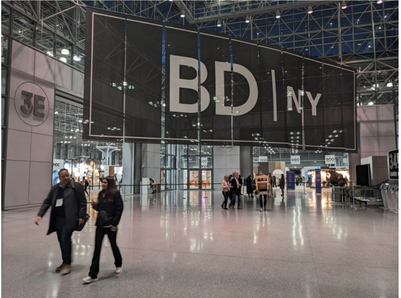
BDNY 2023 at the Javits Center in New York City.