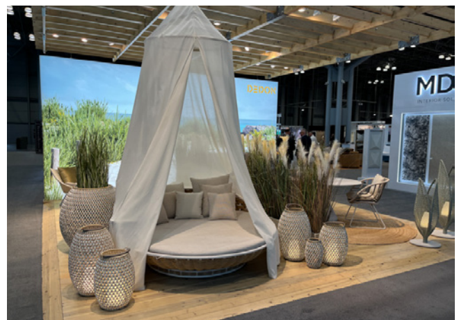
Dedon's outdoor lounge furniture is designed to create a personal oasis.