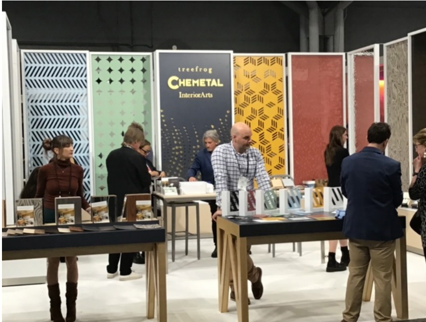
Chemetal's colorful Transparency panels on display.