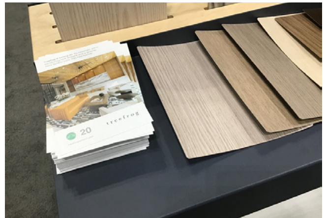
Treefrog celebrates 20 years with the introduction of new designs and a color-matched wood backer.

Furnishings on display referenced design elements with nods to the past, including styles from the archives updated with modern materials or brand-new launches with a retro feel. At emuamericas, the Code chair was on view, an updated version of one of their classic steel chairs. “Code was originally launched over 25 years ago, and this is a