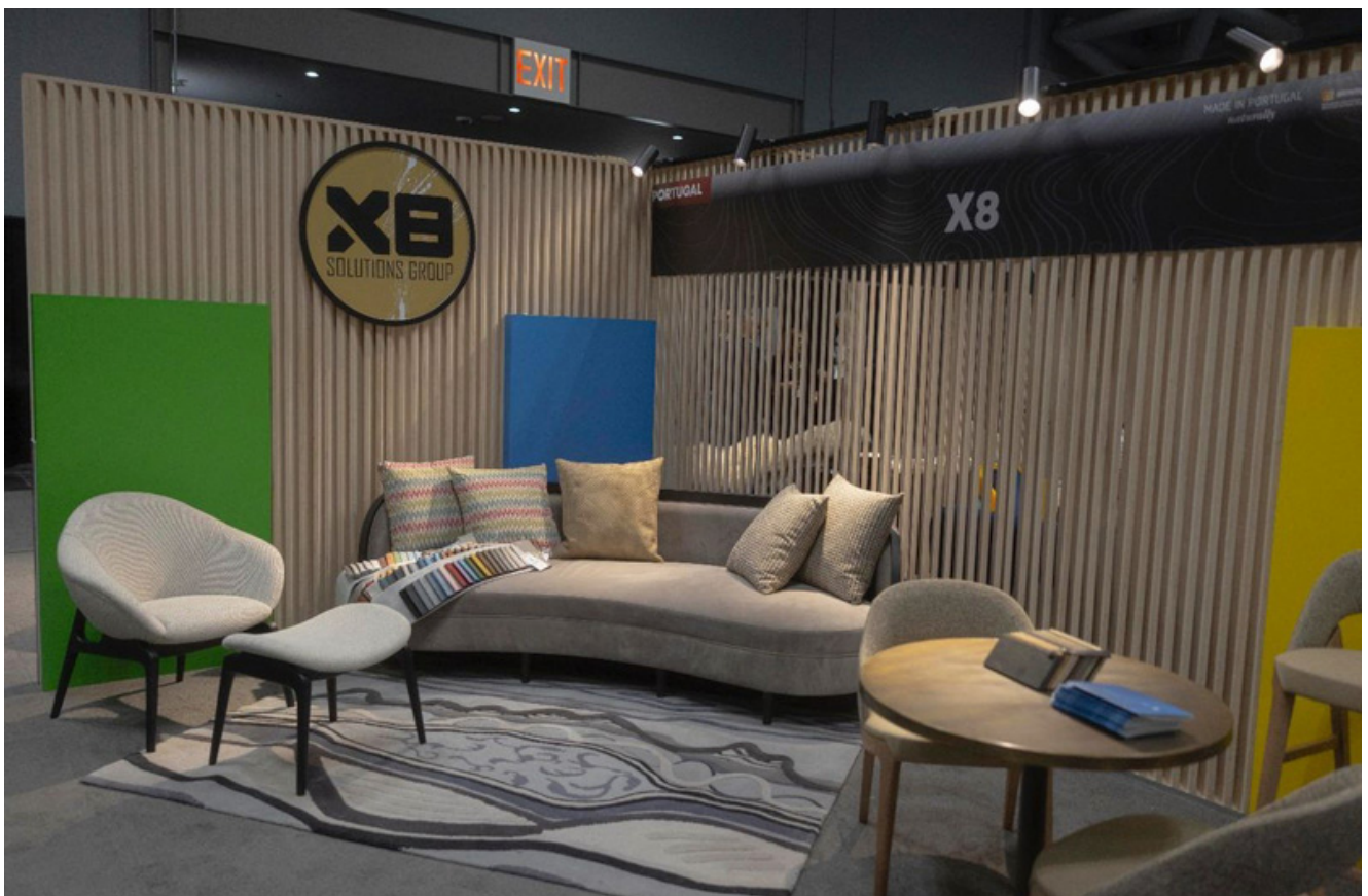
The Portuguese Association of Wood and Furniture Industries (AIMMP) and their member brands exhibited at BDNY for the first time.

The collection of semi-rigid panels, made from 100% recycled PET, feature patterning created by engraving and precision cutouts. With Noise Reduction Coefficient (NRC) ratings