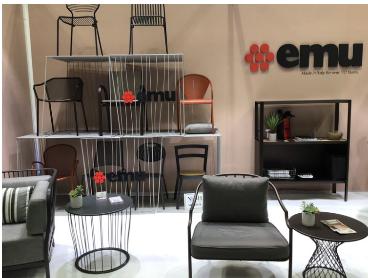
A range of newest metal outdoor seating on view in the emuamericas booth.