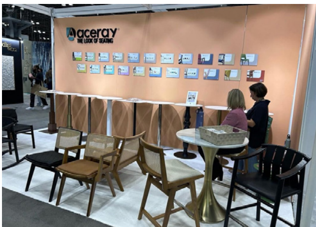
Aceray's booth included a presentation of tables and chairs.