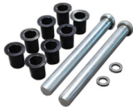
TAILGATE HINGE ASSEMBLY 1 WAY HINGE - ALLOY

Here are a selection of items available for purchase on our online store.