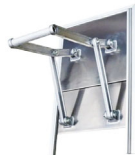
500mm ALUMINIUM GRAIN DOOR