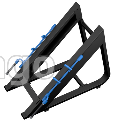
3.INSTALL THE MOUNTING HANDLES ON BOTH SIDES