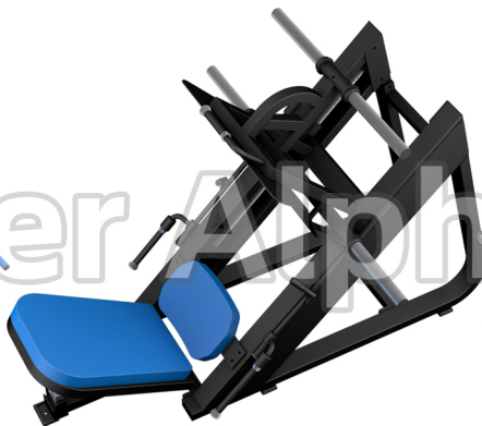
8.INSTALL THE CUSHION