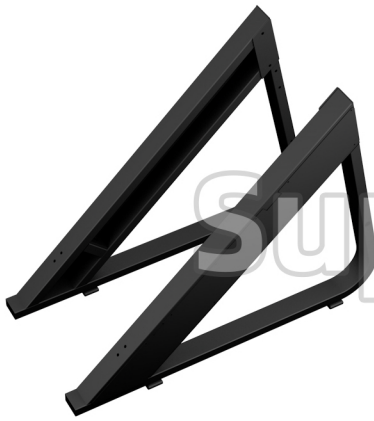
1.FIND THE LEFT AND RIGHT MAIN FRAMES