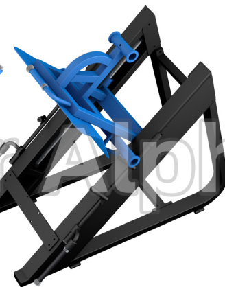
6.INSTALL THE BOLSTER SUPPORT