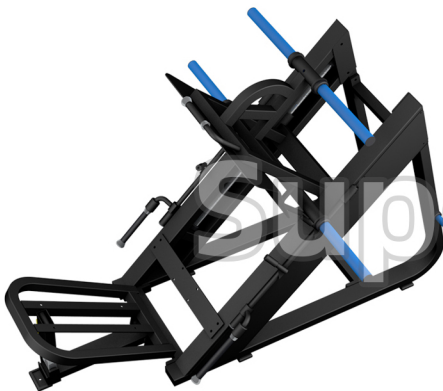
7.INSTALL THE HANGER ROD