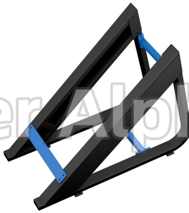
2.INSTALL THREE CONNECTING BEAMS