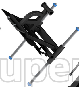
5.PLACE THE RUBBER RING ON THE MAIN FRAME AFTER BOTH ENDS ARE SLEEVED