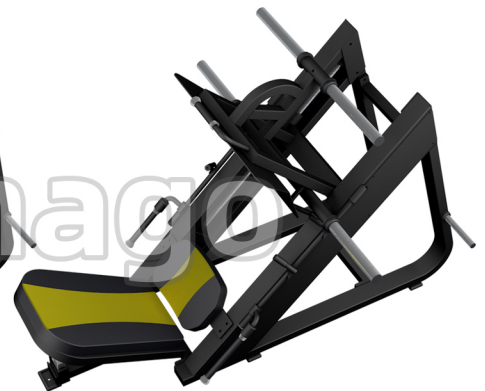
INSTALLATION IS COMPLETE