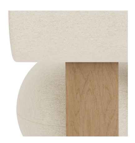
NATURAL OAK BARNUM BOUCLE COL 24