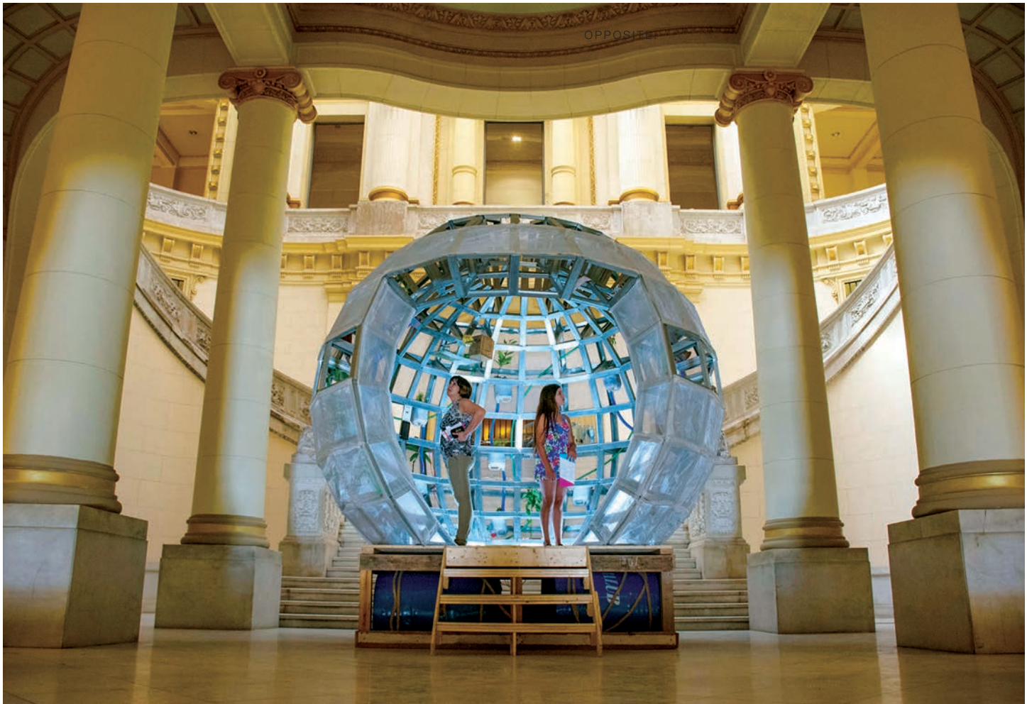
OPPOSITE: COURTESY CLOUD FACTORY / THIS PAGE: MARY MATTINGLY; COURTESY THE BRONX MUSEUM OF THE ARTS AND MUSEO NACIONAL DE BELLAS ARTES DE LA HABANA

a reclaimed barge that travels waterways around New York. There was a kind of provocation in the fact that Swale invoked maritime common law and invited foraging in defiance of local land laws. What has changed between the two iterations of this idea?