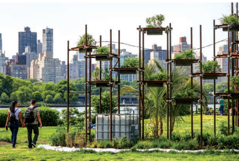
THIS PAGE AND OPPOSITE: Water Clock, 2023. Steel, vessels, found materials, East River water, and salt-tolerant, edible plants, installation view.

So, I developed a particular methodology—I began making sculptures that were wearable and cleaned water, and I would bring them to the desert near where I lived in Oregon and test them as habitats. They got better over time. I photographed the sculptures and then started to combine them with performance. Following that, the sculptures became larger. Sometimes I prioritize interaction between people, and the sculpture becomes a platform for interaction, but it always begins from materials specific to the place and the materials' past life. Sometimes the opposite is true: the sculpture is prioritized, and the interactions that people may have can enliven it.