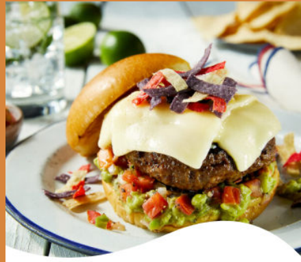
Cooper® Sharp Taco Crunch Cheeseburger