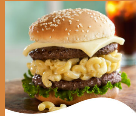
Cooper® The Mac n Cheese Burger You'll [Forever] Be Addicted to