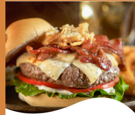
Cooper® Cheese Penn Turnpike Burger