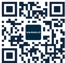
官网 Official Website