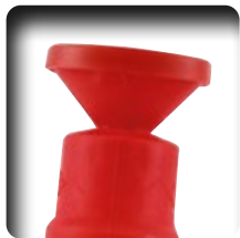
Includes eye bath