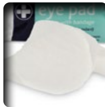
and eye pad dressings

Better for the workplace, better for the planet.