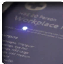
Laser etching, no labels