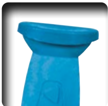
Includes eye bath