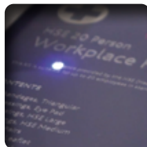
Laser etching, no labels