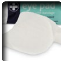
and eye pad dressings

Better for the workplace, better for the planet.