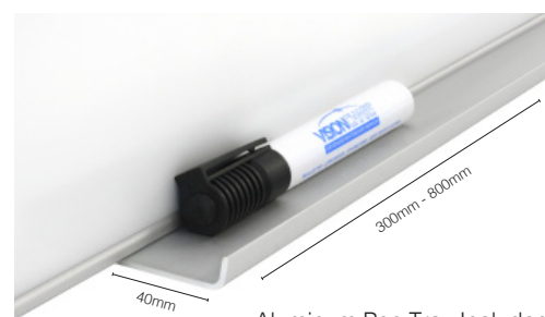
Aluminum Pen Tray Included