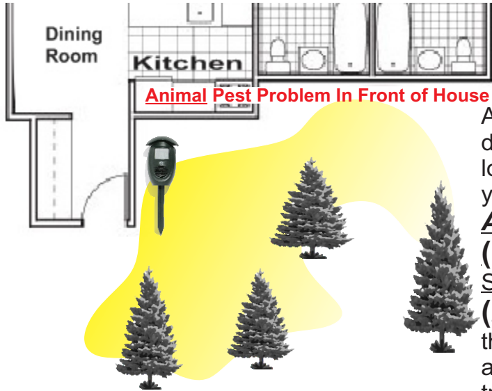
Animal Pest Problem In Front of House

Cleanrth's Super Advanced Ultrasonic Animal Repeller is a very simple device to use. Here are some examples on how the placement of the unit can change the coverage and results.