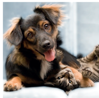
Safe for all your Family