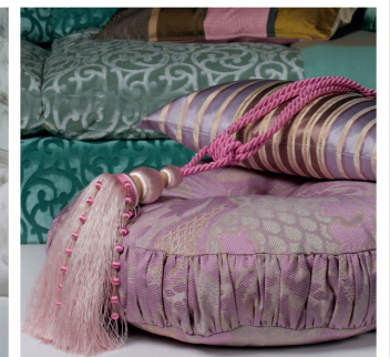
Perfect for Fine Silks

FOR MORE INFORMATION, VISIT www.microsealuk.com or CALL 0203 005 3229