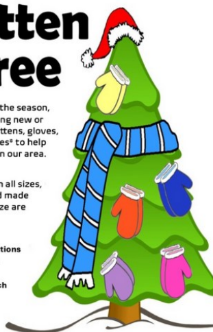
Sponsored by the Holdrege Methodist Outreach Committee