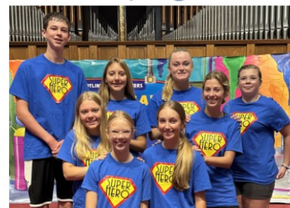
Youth Group, 7-8:30 pm