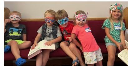
Pre K-6th Classes, 4-5 pm