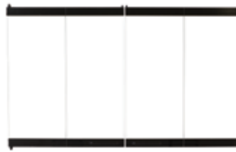
Bi-fold glass doors